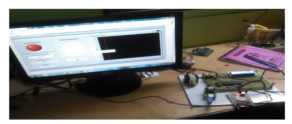
Figure 3. Experimental Setup In Control side

GSM module act as both transmitter and receiver. It receives a data from the GSM module of field side in the form of coded signals using AT commands. MAX 232 is used for serial interface.PIC works in TTL logic level and operates at 5V.Hence MAX 232 is used to convert coded data signals into TTL logic. PC is used to acquire data from controller and displays the moisture content of the soil is graphically shown in LabVIEW.