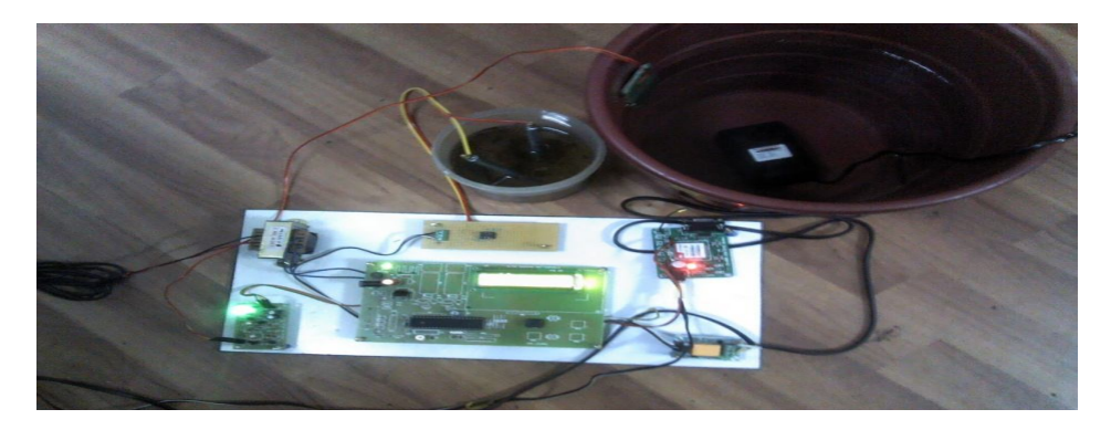
Figure 2. Experimental Setup In Irrigational Area

Soil moisture probe is used to measure the amount of soil moisture present in the soil based on conductivity of the soil. Two zinc electrodes are placed to the depth of the soil. It measures the soil value in terms of voltage. It provides the voltage value in the range of 0-5V. Water is filled inside a tank in which water sensor is kept to measure the amount of water content in a tank. Motor starts to pump the water for discharging to the field, when the moisture content is dry. At the same time motor stops to pump the water for discharging. GSM module can be either interfaced with the PIC microcontroller or PC directly. GSM act as transmitter and receiver. It transmits the moisture content to the receiver side of another GSM module. The sensor values can be sent in the form of coded signal in terms of SMS using AT commands. PIC microcontroller has inbuilt ADC conversion and other features. It has capacitor to eliminate noise from the chip. Bridge rectifier is used to convert AC to DC. Regulator is used to regulate 12V DC to 5V AC.